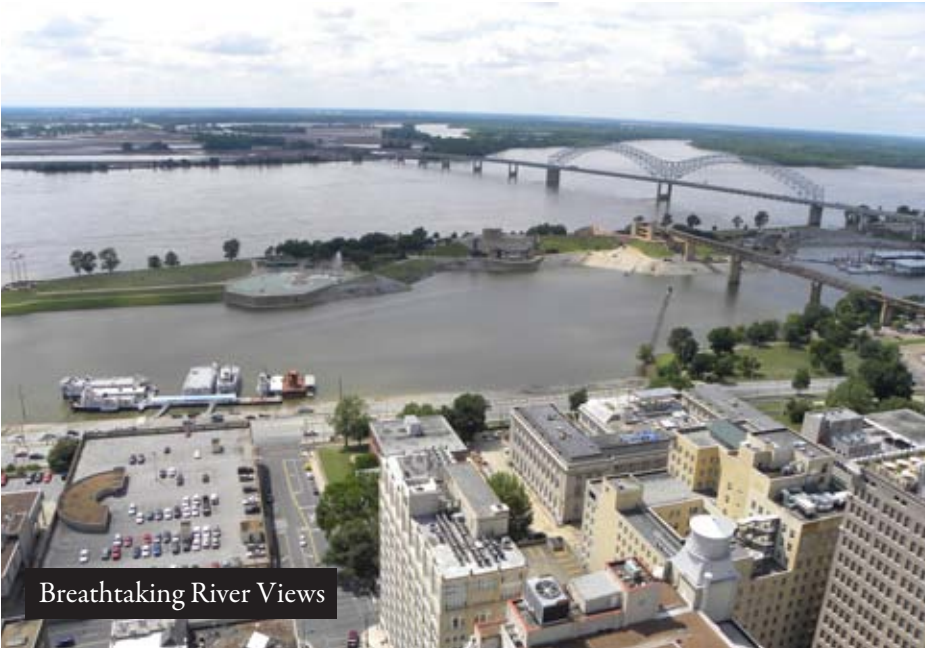
Breathtaking River Views